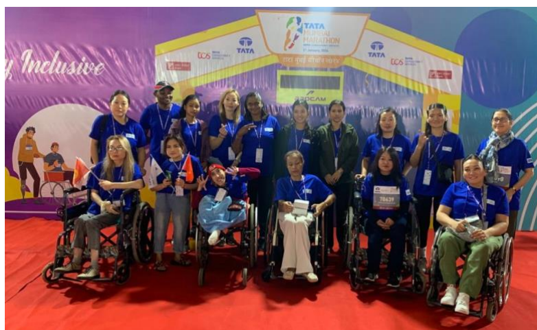
CII 2024 Participants at the Mumbai Marathon

We started off the year with the highly anticipated Community Initiative in Inclusion (CII) course at ADAPT in Mumbai. It was truly heartening to see 21 participants from a diverse range of countries, including Bhutan, Cambodia, India (Mumbai), Nagaland, Malaysia, Mongolia, Nepal, Tajikistan, Tibetan Government in Exile. I am delighted that this year we welcomed a participant from Kyrgyzstan, and a delegate from Kenya, coming together with a shared goal of promoting inclusivity and understanding.