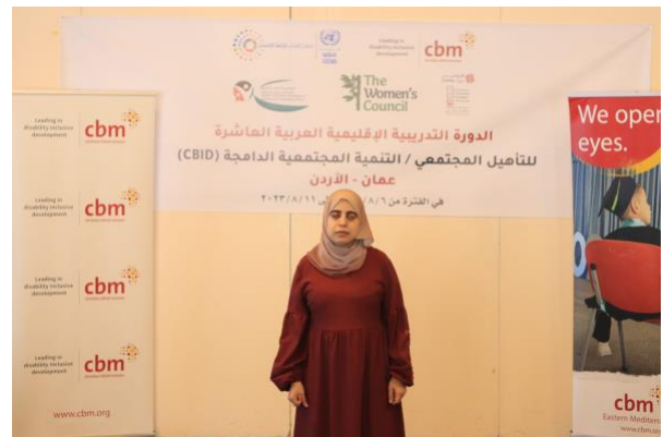
SETI participant from Jordan